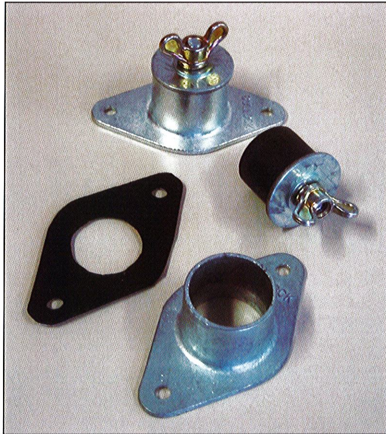
Bullock Instrument Access Port

Bullock manufacture this convenient ACCESS PORT for industrial, commercial and residential air-conditioning and ventilation applications. This unintrusive, resealable access port is ideal for assisting in the camera access checking of fire dampers, monitoring of air quality and balancing of air quantities in ducts and conditioner housings.