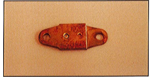
Multi Blade Type Fire Damper Fusible Link Temp Rated - 68 Deg. C (155 Deg. F) Complies AS1530.4 Product Code # 4801