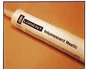
Lorient Intumescent Mastic Colour - Grey 310g Tube 4 Hour Fire Tested Mastic Sealer Product Code # 1267 Carton Quantity 20