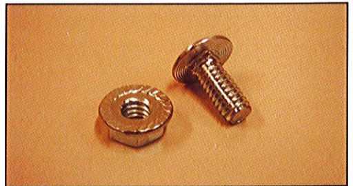
Fire Damper Flange Cup Head Bolt and Wizz Nut Product Code # 5630 - Cup Head Bolt Product Code # 5631 - Wizz Nut