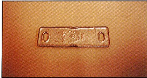
Curtain Type Fire Damper Fusible Link Temp Rated - 73 Deg. C (165 Deg. F) UL33 Tested - Complies AS1530.4 Product Code # 4903