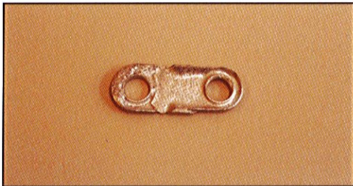
Drop Lock Type Fire Damper Fusible Link Ceiling Radiation/Fire Damper Fusible Link Temp Rated - 68 Deg. C (155 Deg. F) UL33 Tested - Complies AS1530.4 Product Code # 5460