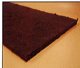
Fire Damper Insulation Strip Temp Rated - 1160 Deg. C Strip Size: 750 x 225 x 13mm UL33 Tested - Complies AS1682.2 Product Code # 1257