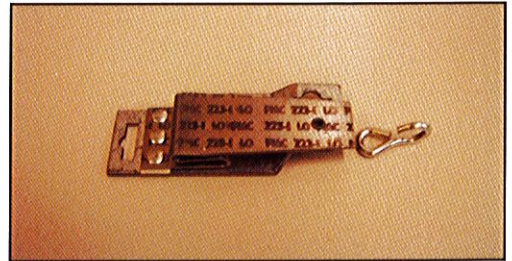
McCabe Reuseable Bi-Metallic Thermal Link Temp Rated - 73 Deg. C (165 Deg. F) UL33 Tested - Complies AS1682.1 Product Code # 5720