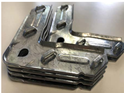
EZ Cornermatic TDC Strapack® Code #1240/EZctnTDFcornermatic 80 per Strapack®