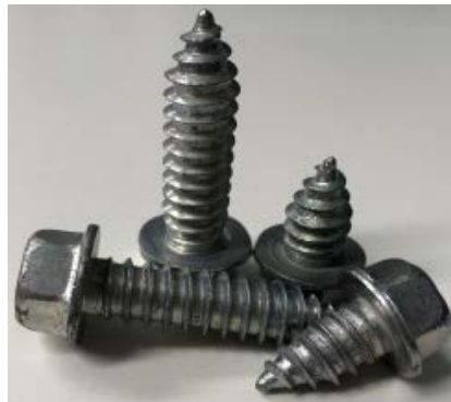
EZ Bolt 1.5 Bolt Code #1240/EZ1.5Bolt 0.75 Bolt Code #1240/EZ3/4Bolt

Manufactured from 1.5 Galvanised Steel. The EZ Corner is available for both TDF & TDC Duct and come packed in the popular Strapack® format. The patented "Tear Drop" hole in conjunction with the EZ Bolt is the next revolution in duct installation.